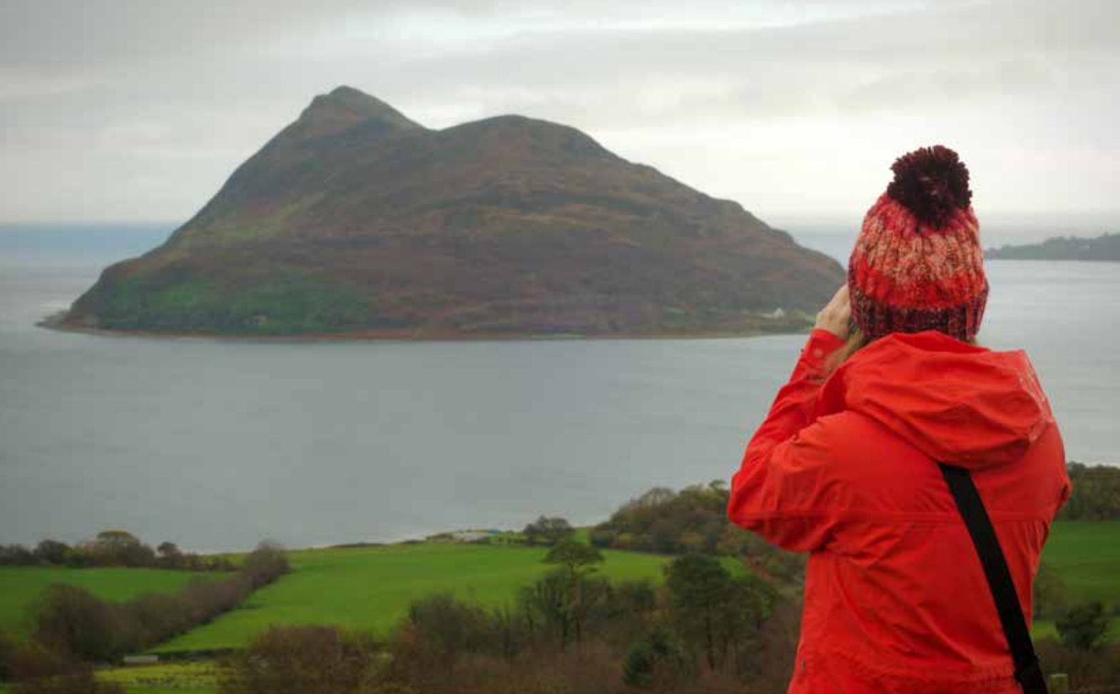
Isle of Iona